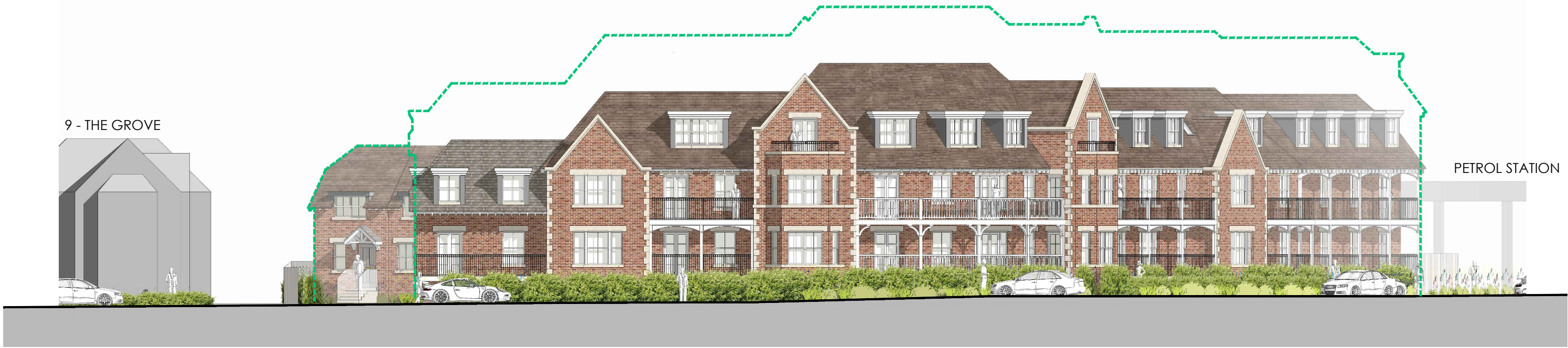
PROPOSED STREET SCENE - THE GROVE ( FOR INDICATIVE PURPOSES ONLY ) SCALE 1:200