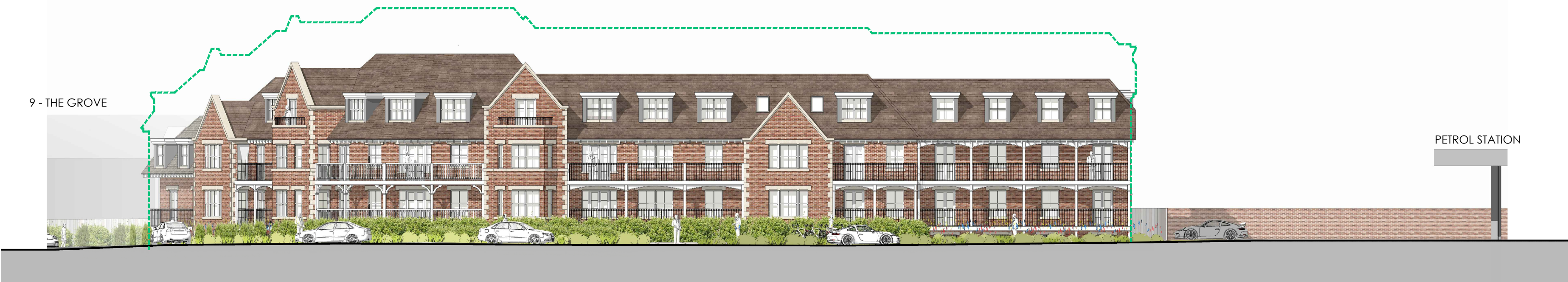
PROPOSED STREET SCENE - BARRACK ROAD ( FOR INDICATIVE PURPOSES ONLY ) SCALE 1:200