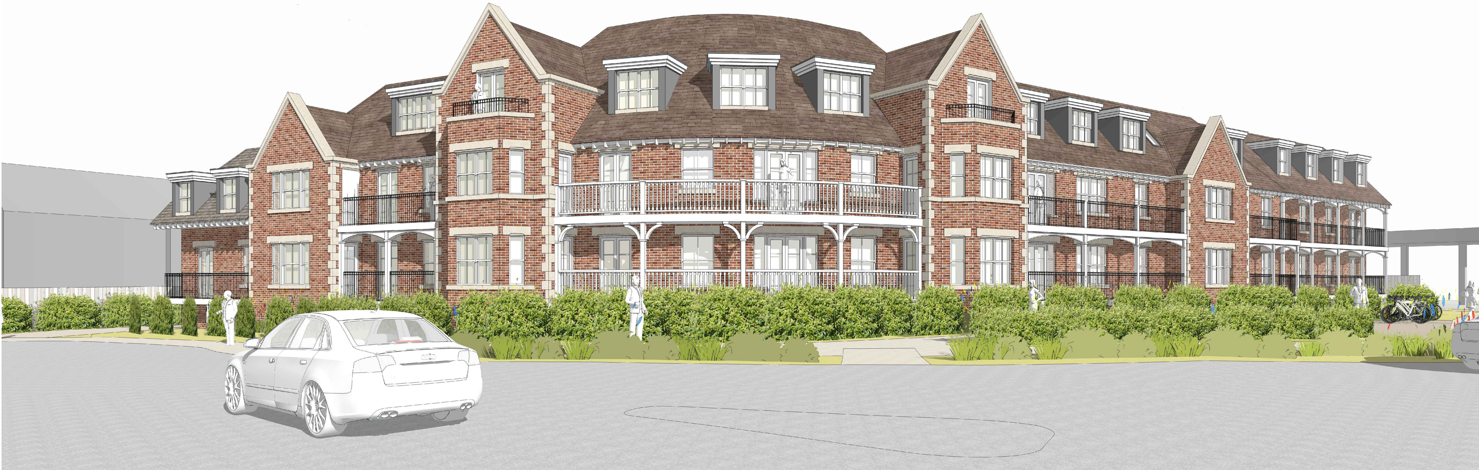
PROPOSED VIEW ( FOR INDICATIVE PURPOSES ONLY )